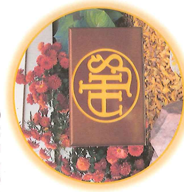
PAINTED EMBOSSED CONCRETE STONE